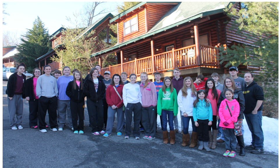
CYC group photo