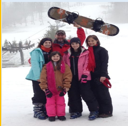
The Cross family enjoying their day on the slopes!